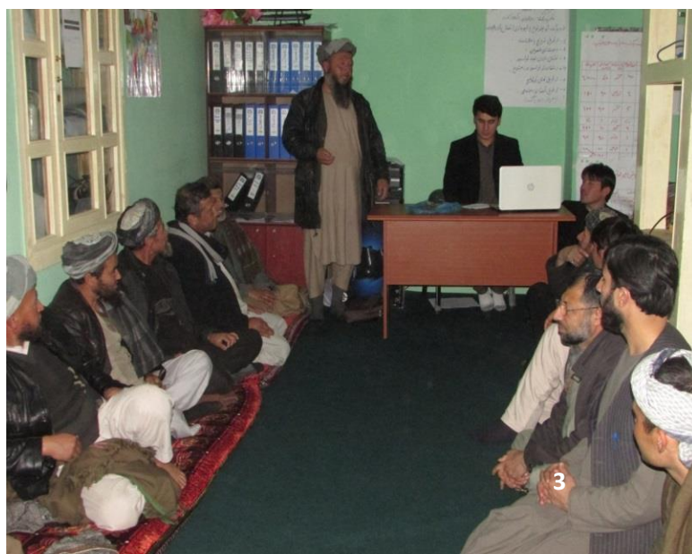
3 Community Members Meeting | Gosfandi District | Sarepul Province