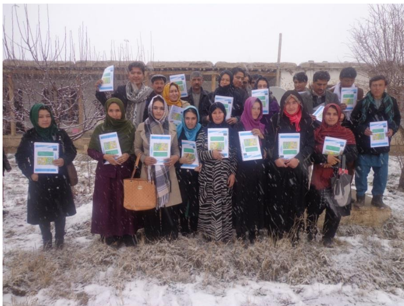
SHG Members Completed BDS Training Module | DSB | Samangan Province