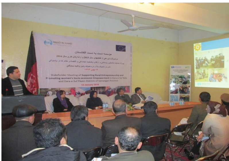
Stakeholders Meeting | Samangan Province