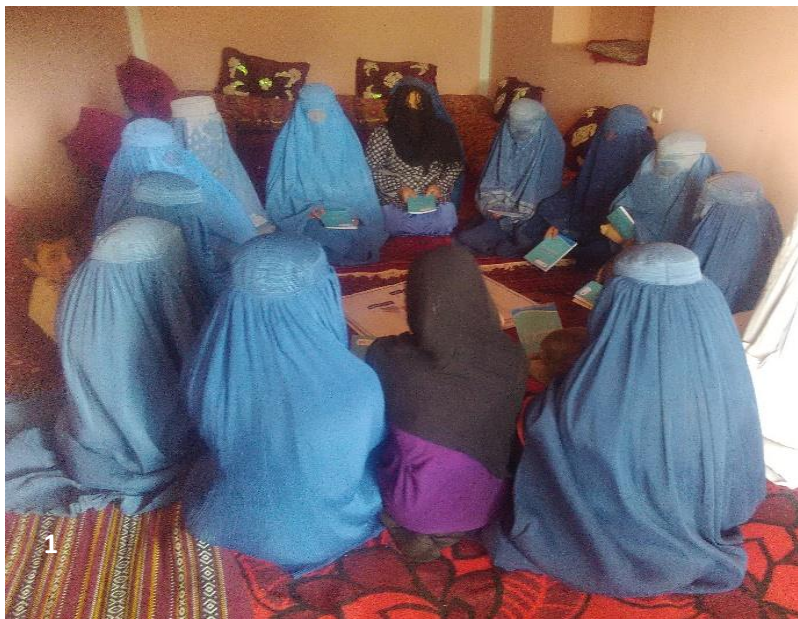
1 Women members during an Internal Saving Discussion | Sancharak District | Sarepul Province