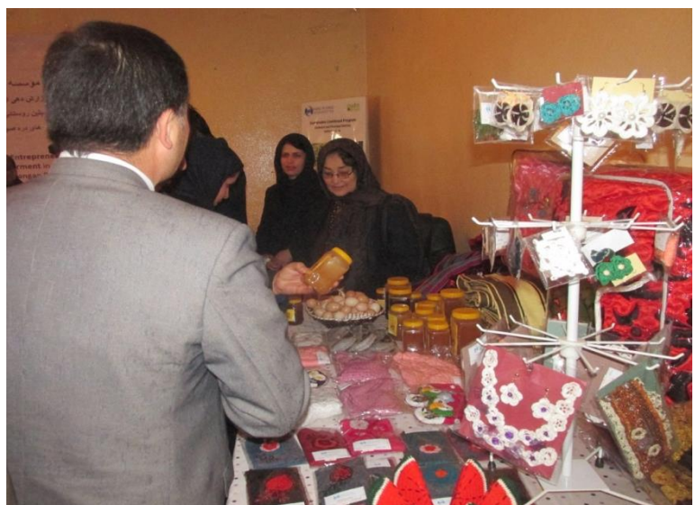
SHGs Products Exhibition at the end of Stakeholders Meeting | Samangan