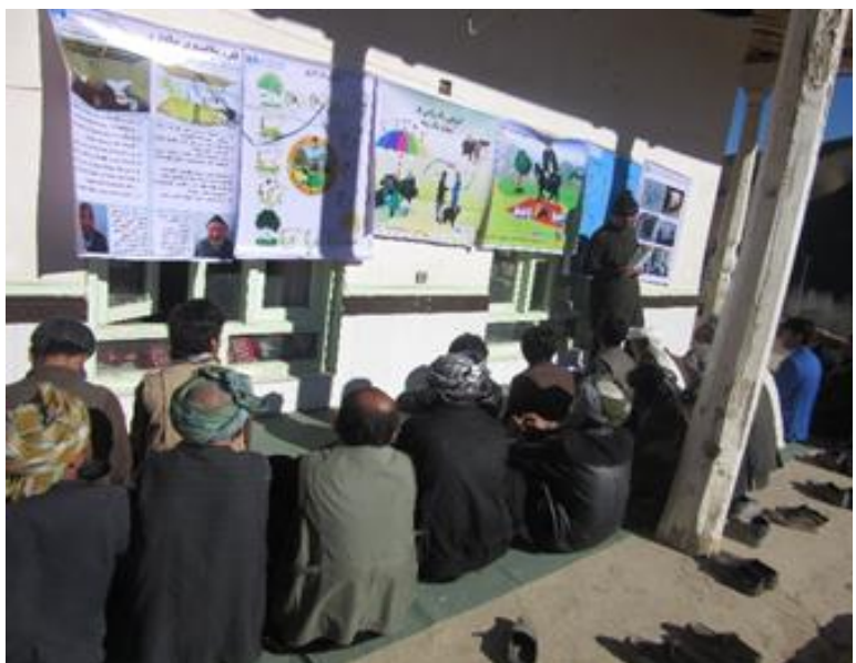
Livestock Training in | Sancharaki District | Sarepul Province