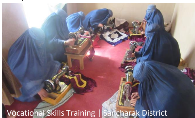
Vocational Skills Training | Sancharak District

Moreover, 117 SHG members received enterprise startup kits in order to establish their micro-enterprises.