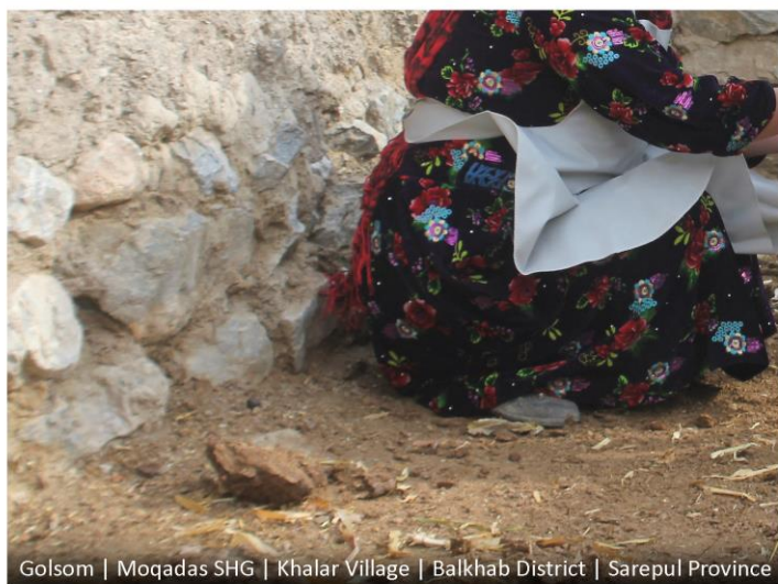
Golsom | Moqadas SHG | Khalar Village | Balkhab District | Sarepul Province