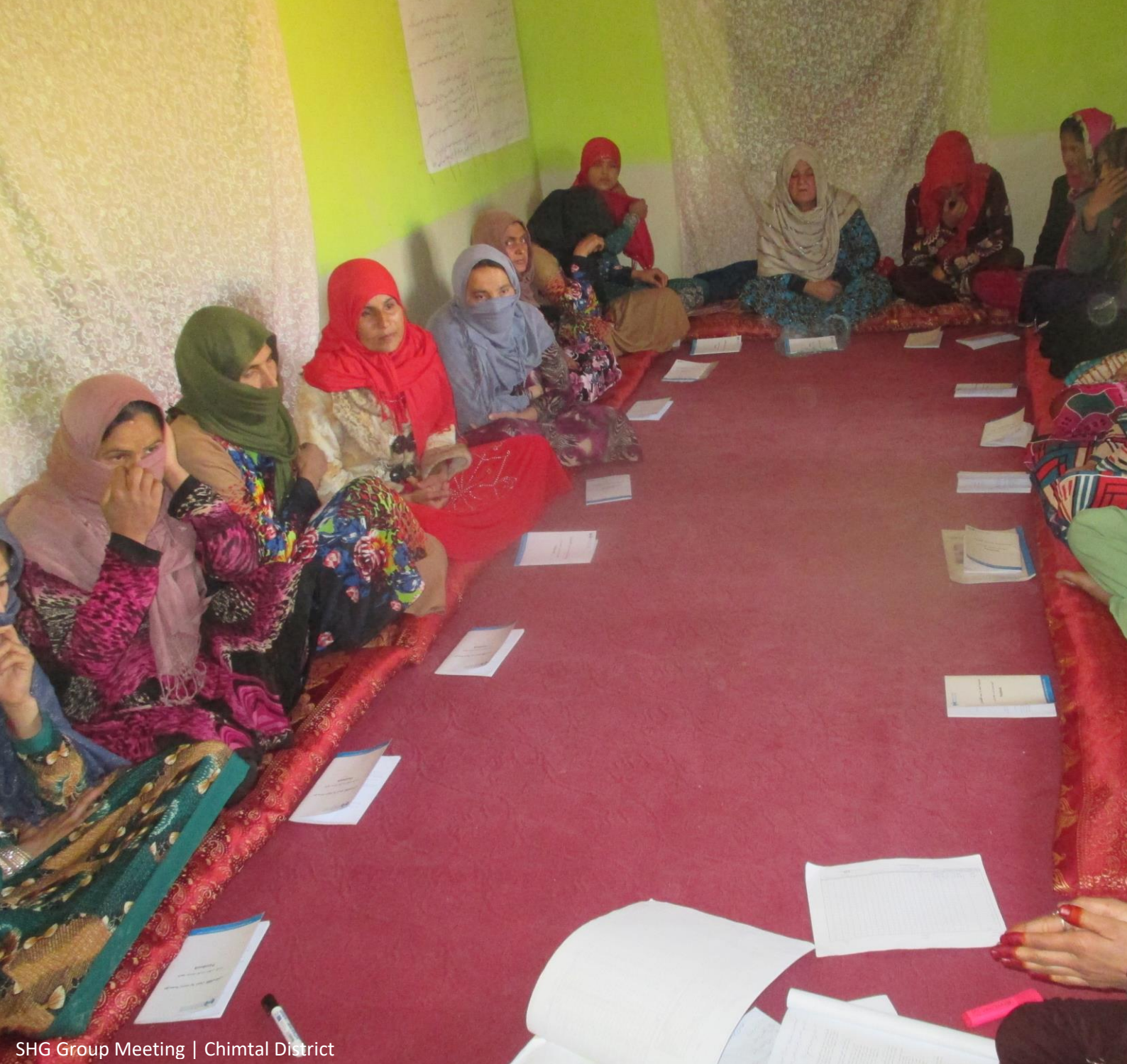
SHG Group Meeting | Chimtal District