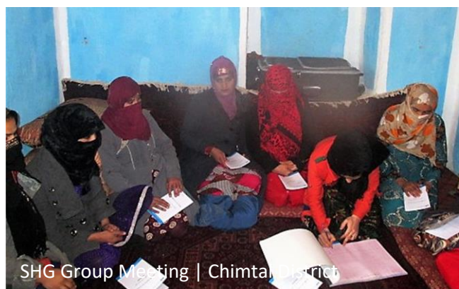
SHG Group Meeting | Chimtal District

Both the formation and enhancement of microenterprises have resulted in creation of 361 jobs for the community members.