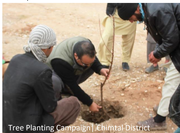
Tree Planting Campaign | Chimtal District

The campaign was organized in close collaboration with the Agriculture Department and Community Development Councils.