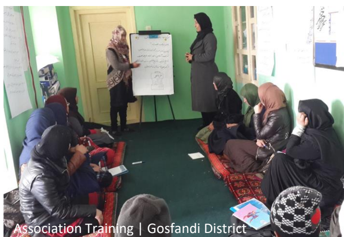
Association Training | Gosfandi District