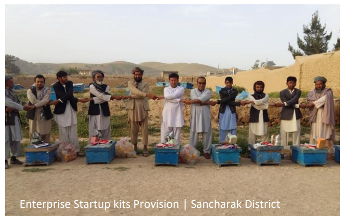
Enterprise Startup kits Provision | Sancharak District

Additionally 84 ( 66 female) members completed vocational skills training in handicraft, tailoring, livestock, and beekeeping sectors.