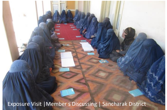
Exposure Visit | Member s Discussing | Sancharak District

In these exposure visits members interacted and learnt from each other's successes and challenges. They asked each other questions about market, customers and prices and also they promised to share learning from the visit with other members in their respective communities.