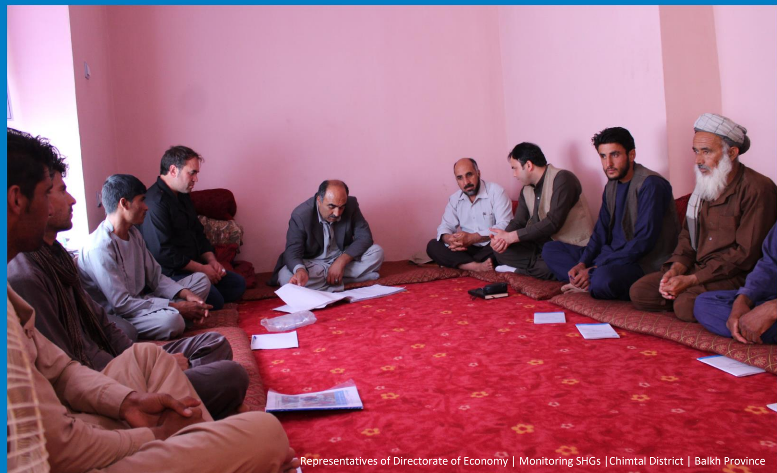
Representatives of Directorate of Economy | Monitoring SHGs | Chimtal District | Balkh Province