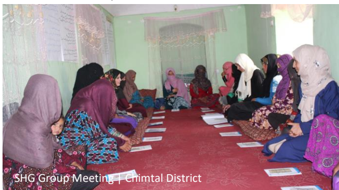
SHG Group Meeting | Chimalt District

Both the formation and enhancement of microenterprises have resulted in creation of 905 jobs for the community members.