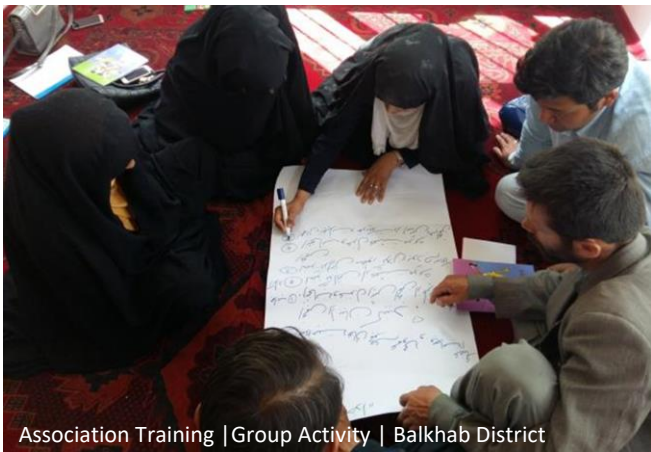
Association Training | Group Activity | Balkhab District

After receiving these training the board of directors of central association's capacity were built to properly administer and manage their associations' activities according to law and regulations and also they better understood role of association as well as association's social responsibilities.