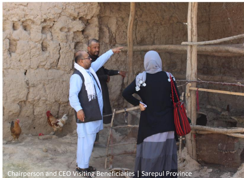
Chairperson and CEO Visiting Beneficiaries | Sarepul Province