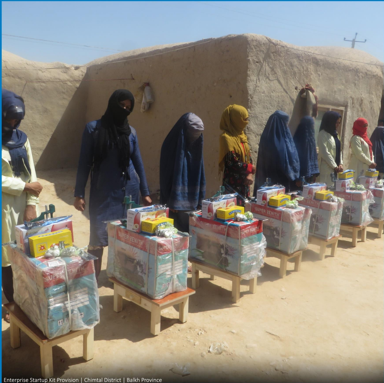
Enterprise Startup Kit Provision | Chimtal District | Balkh Province