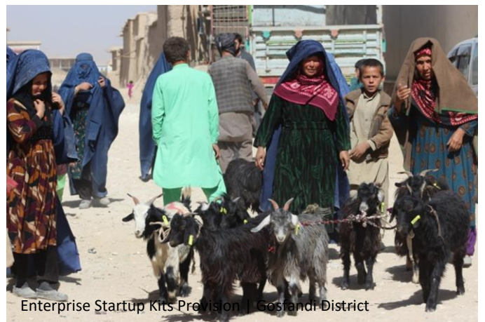
Enterprise Startup Kits Provision | Gosrandi District

Additionally, another 200 (186 female) members who previously completed their vocational skills training received enterprise startup kits in Balkh and Sarepul provinces in order to establish or enhance their micro-enterprises.