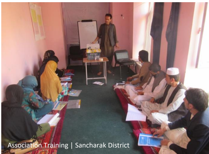
Association Training | Sancharak District

After receiving these training the board of directors of central association's capacity were built to properly administer and manage their associations.