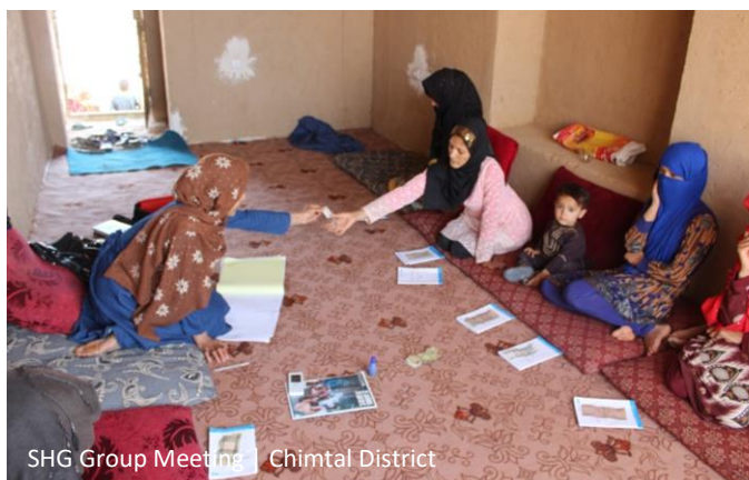
SHG Group Meeting | Chimtal District

The internal loans, enterprise startup kits, formation and enhancement of micro enterprises have resulted in creation of 215 (203 female) jobs for the community members.