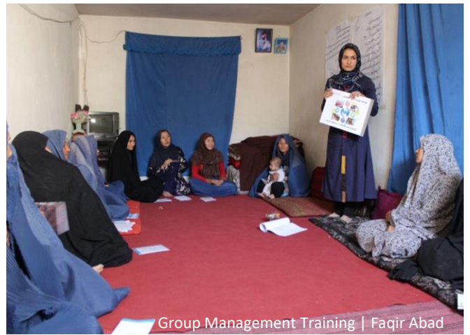
Group Management Training | Faqir Abad

Total of 111 members (all female) attended and the training will be followed by Micro Finance Training.