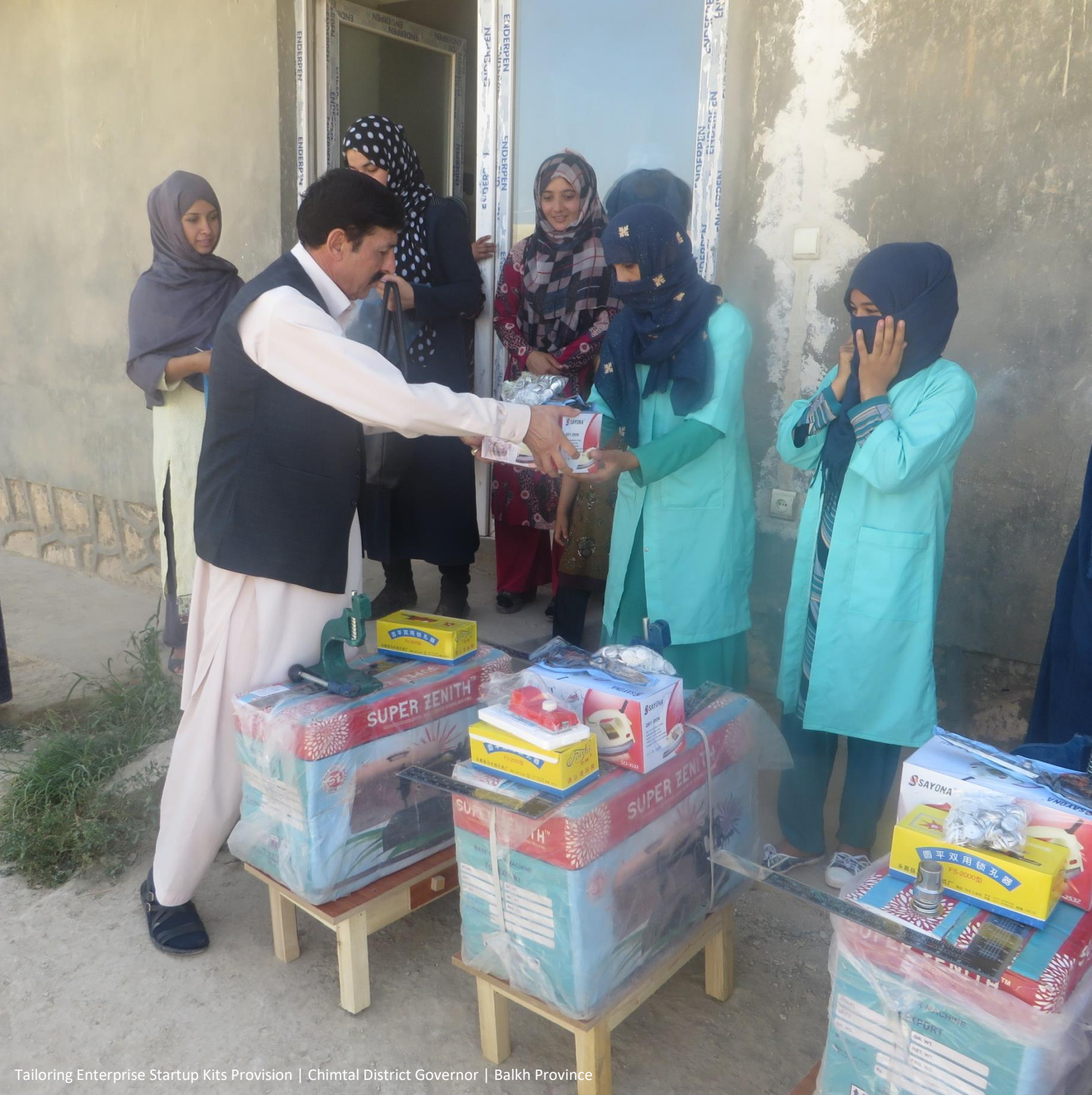
Tailoring Enterprise Startup Kits Provision | Chimtial District Governor | Balkh Province