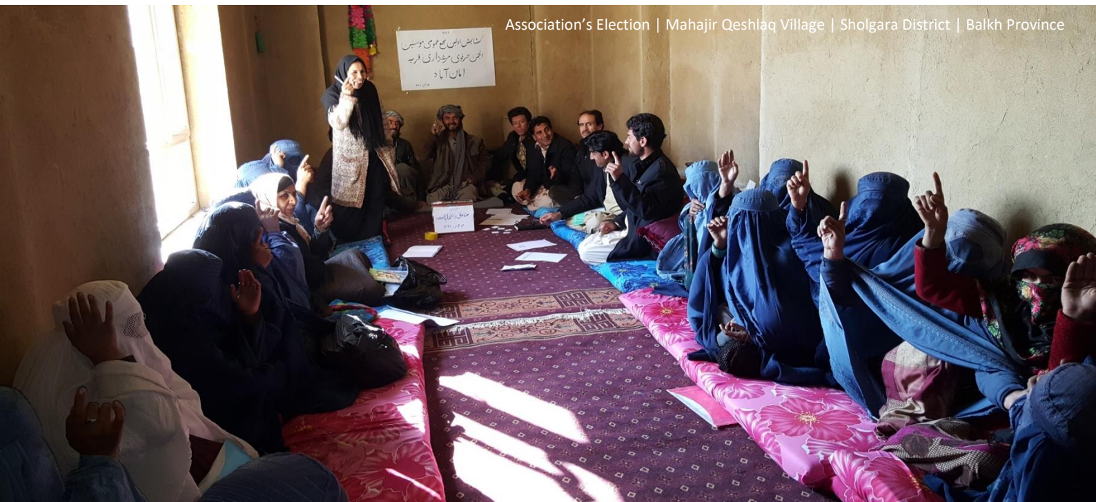
Association's Election | Mahajir Qeshlaq Village | Sholgara District | Balkh Province

Hand in Hand Afghanistan establishes associations in order to bring rural entrepreneurs together and ensure sustainability of micro-enterprises by adding value to their products, linking them to market, conducting training and mentoring visits.