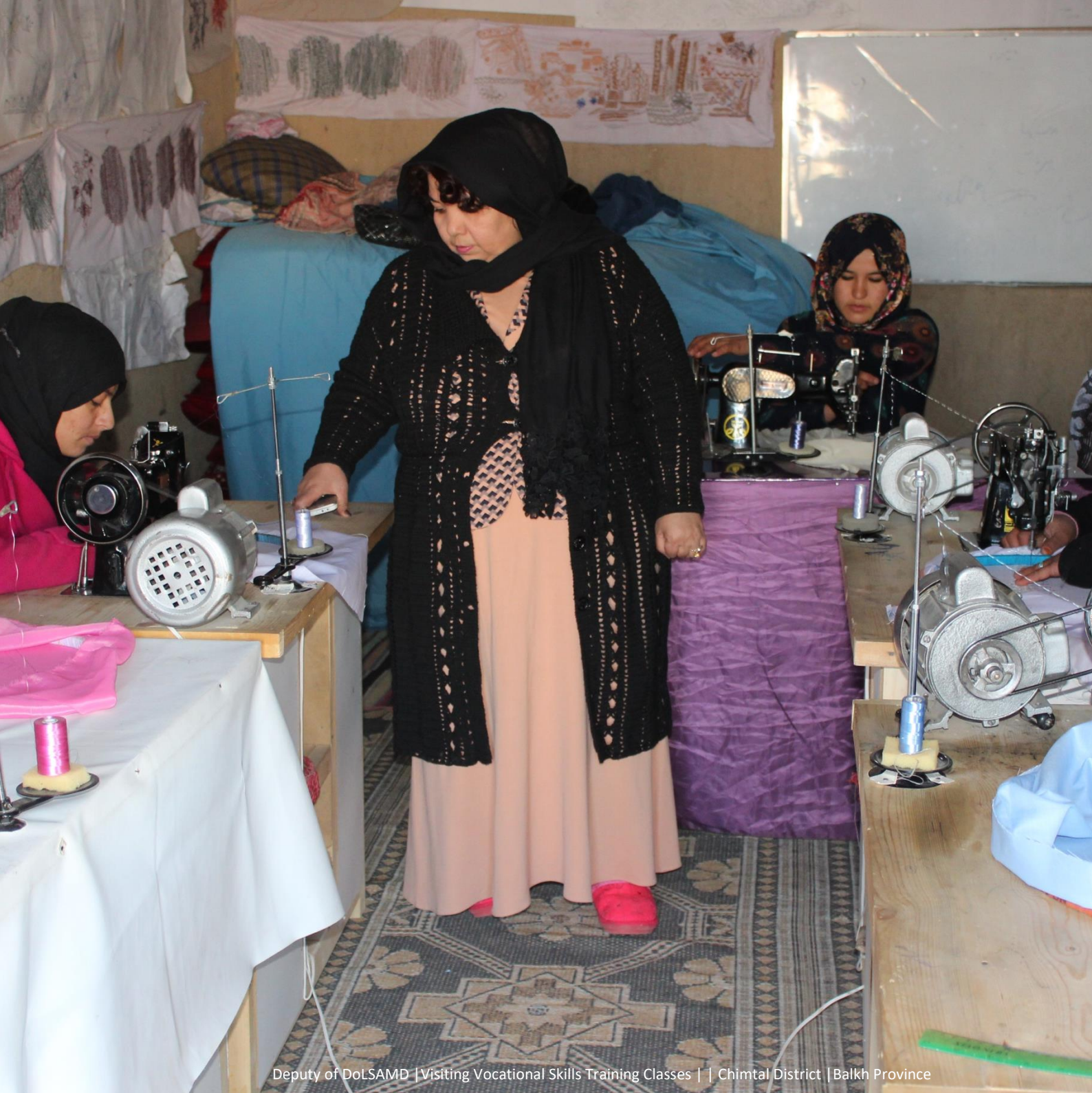
Deputy of DoLSAMD | Visiting Vocational Skills Training Classes | | Chimtāl District | Balkh Province