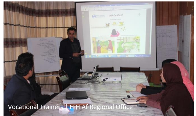
Vocational Trainers | HiH Af Regional Office

In this training 5 vocational trainer participated and these trainers will be training returnees and IDPs in order to capacitate them on running poultry farms.