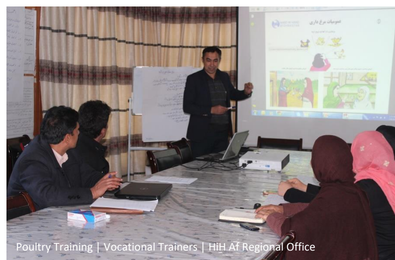
Poultry Training | Vocational Trainers | HiH Af Regional Office