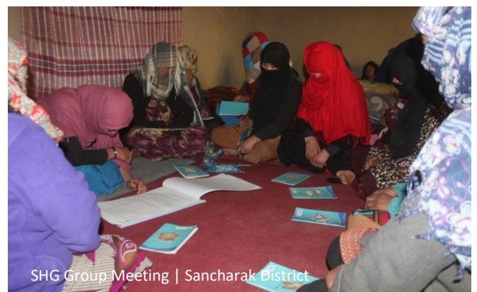
SHG Group Meeting | Sancharak District

The internal loans, enterprise startup kits, formation and enhancement of micro enterprises have resulted in creation of 23 (11 female) jobs for the community members