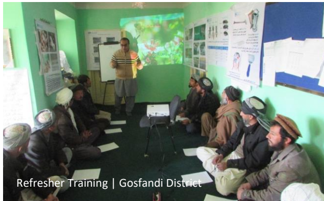
Refresher Training | Gosfandi District

These trainers will further train 1,913 SHG members on above topics to ensure capacity of entrepreneurs are built in running their relevant business.