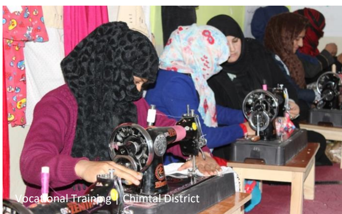
Vocational Training | Chimtal District

Additionally, another 12 (3 female) members who previously completed their vocational skills training received enterprise startup kits in Balkhab, Gosfandi and Sancharak districts of Sarepul province in order to establish or enhance their micro-enterprises.